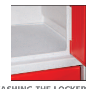
AFTER WASHING THE LOCKER THE SLOPING SHELF DIRECTS WATER TO THE DRAIN HOLE Drain hole is sealed on Ultrabox plus

*The drain hole is sealed on the Ultrabox Plus version