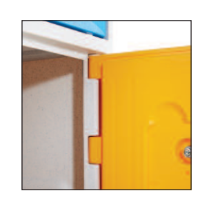
HEAVY DUTY, VANDAL PROOF CONCEALED HINGES