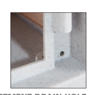
COMPARTMENT DRAIN HOLE SITS NEATLY OUT OF SIGHT BEHIND THE DOOR*