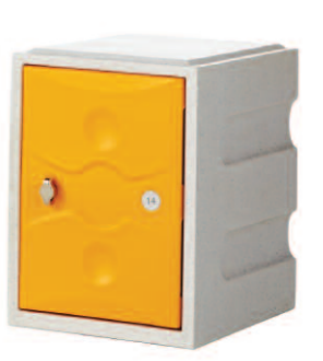
MINI BOX 2