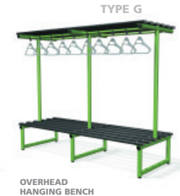
double sided with polymer slats and anti-theft hangers

Units maybe supplied in component format including all necessary fixings (excludes wall and floor fixings). All sizes nominal. We reserve the right to alter design and specification without prior consent.