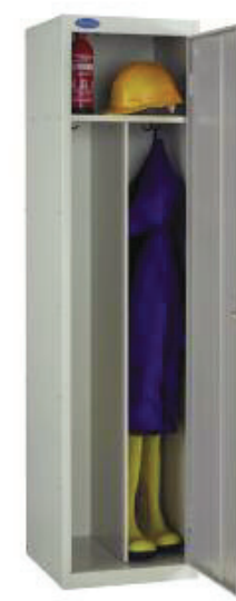
CLEAN & DIRTY LOCKER Complete with full width internal top shelf 305mm high, vertical centre partition and two double coat hooks.

WIDTH 460mm DEPTH 460mm TOP COMPARTMENT HEIGHT 305mm