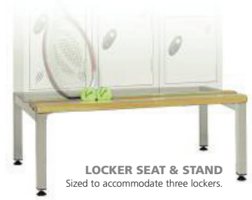
LOCKER SEAT & STAND Sized to accommodate three lockers.

*Terms & conditions apply, see web for details.