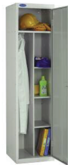
UNIFORMS LOCKER Complete with full width internal top shelf 305mm high, vertical centre partition, double coat hook and a further three half width shelves.

WIDTH 460mm DEPTH 460mm TOP COMPARTMENT HEIGHT 305mm